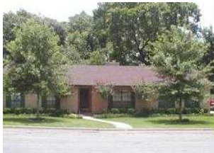
201 North Hunt,