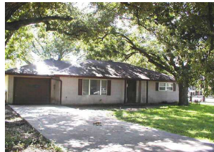
407 South Matthews,

Comments: Extra Neat & Tidy! Great Location. Across The Street From Bellville Hosp 2 Blocks Rom The Square, Library & Walking Distance To Mini