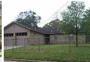
733 East Mill, Bellville,

Comments: Precious And Charming 2 Bedroom 1 Bath Home Several Blocks From Bellville Square And Bellville Intermediate/Elem.