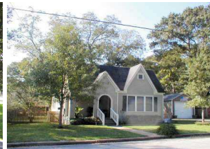
313 Austin, Bellville,

Comments: Spacious Frame Home Located Next Door To Obyrant Elem. Gate In Back Yard Opent To School Grounds. Very Convenient For Someone